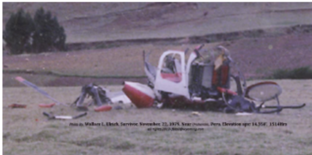
Crash Site, shortly after crash, near Urubamba, Peru 15:14 HRS November 22, 1979 by W.L. Ulrich